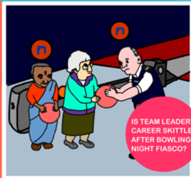
IS TEAM LEADER'S CAREER SKITTLED AFTER BOWLING NIGHT FIASCO?

1940s HIGH BIRTH RATE DUE TO NOTHING ON TV CLAIMS 86 YEAR OLD GREAT GRANDMOTHER OF 6