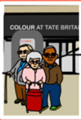
"Tate Modern café's a bit pricey" THE GIRDLESTONE 3RD AGE GROUP VIEWS ON CONTEMPORARY ART